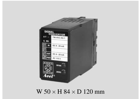
W 50 × H 84 × D 120 mm